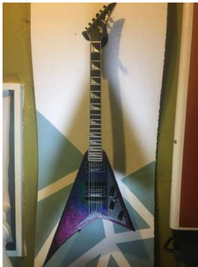
Jackson USA Randy Rhoads Ernie Dess Swirl Finish

Our Mic Locker includes three Shure SM 58's, three Sennheiser MD 421 dynamic mics, three Audio Technica ATM10a pencil condenser mics, a pair of Cascade Fat Head Ribbon Mics, a pair of modified MXL 990 condenser mics, a pair of Studio Projects B1 condenser mics, a Behringer C-1 condenser mic, an MXL 991 pencil condenser, a Blue Bluebird condenser mic, a Shure BETA 52 dynamic mic, an Apex 125 dynamic mic, a Sennheiser e-835 dynamic mic, and a Peluso P-22-251 tube condenser mic. We have an extensive collection of unique, boutique and vintage instruments and amplifiers for use in the studio.