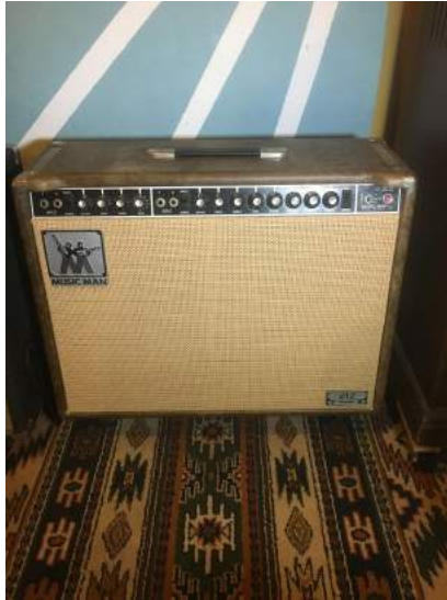
Music Man 212 Sixty Five