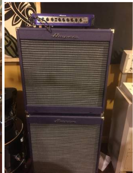
Ampeg Purple Monster

Our Beach Stage, Performing Arts Theatre and Dining Hall are all outfitted with Omnisistem Beta 3 Active Compact Line Arrays. The Beach Stage and Performing Arts Theatre are both outfitted with Behringer X32 Compact Mixers and S16 Stage Boxes as well as Alto Powered Monitors. Additionally we have a passive full range Peavey sound system for more spontaneous performances in various locations on camp.