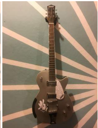
Gretsch Electromatic Jet Club