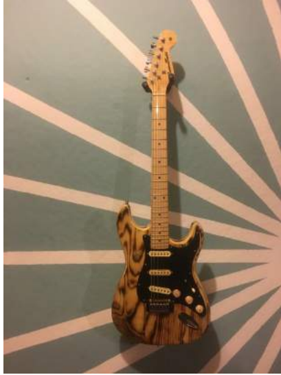
Custom Build charred Strat Tele