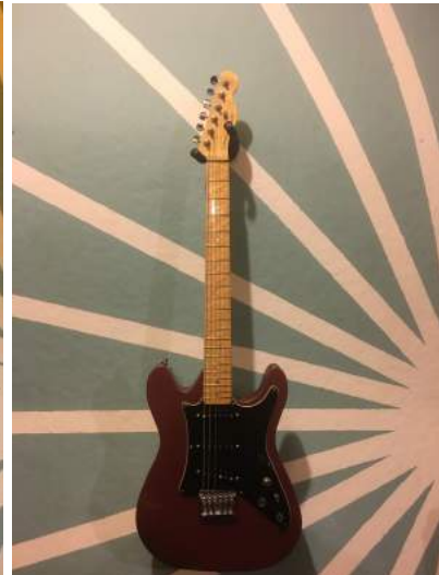
Calaveras Fretworks Catalpa