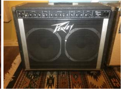
Peavey Classic Chorus 120