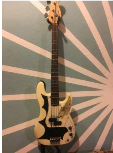
Squire "Wolf" P-Bass Custom Hand Painting