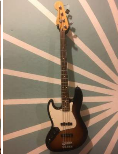
Fender Lefty/Righty Jazz Bass