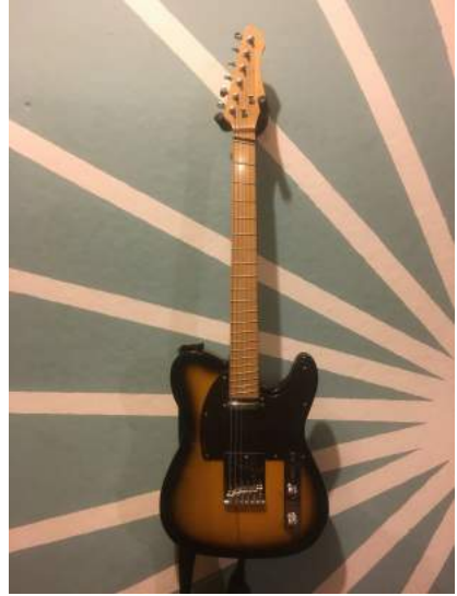
Unknown custom fan-fret