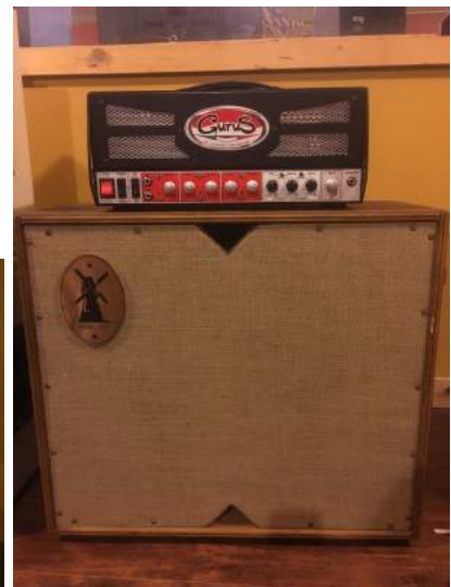
Gurus Amps Naked