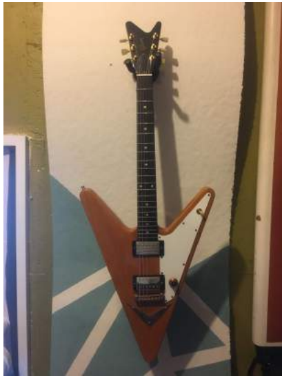
Gibson Reverse Flying V