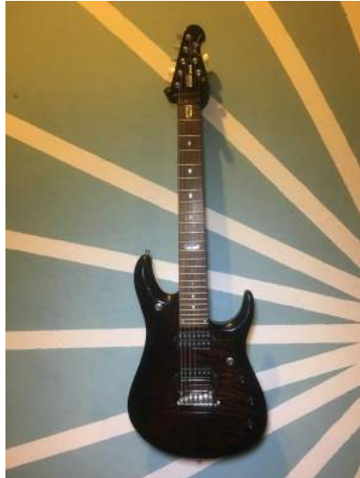
Ernie Ball Music Man BFR John Petrucci 7 string