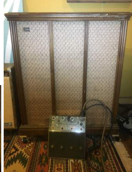
Vintage Leslie Rotating Speaker