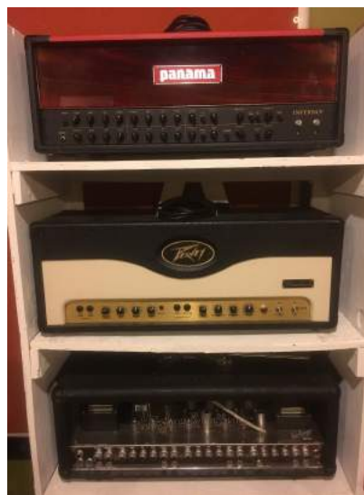
Panama Inferno Peavey Windsor Hughes & Kettner TriAmp MK2