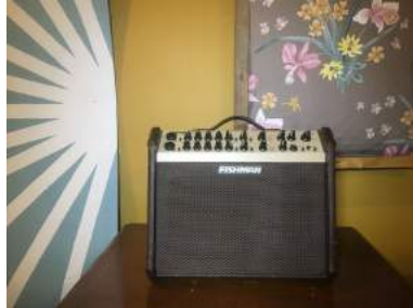
Fishman Loudbox Artist