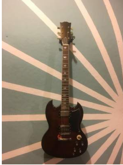
Unknown custom SG