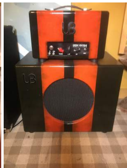
Unique Boutique Amplification