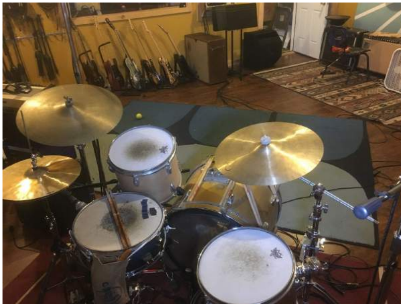
Vintage Slingerland Drums with Vintage Zildjian and Modern Portaflex Dream Cymbals