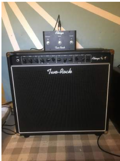
Two Rock Akoya Combo