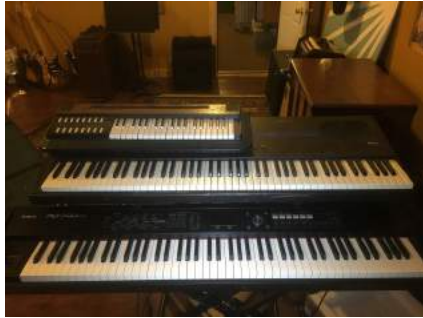
Vintage Chord Organ Vintage Kurzweil RG 100 Roland RD 700 NX