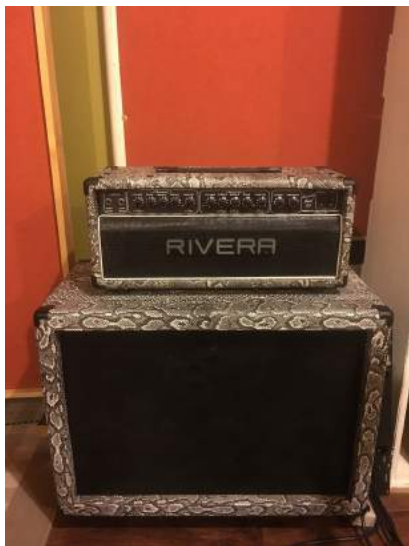
Rivera Knucklehead '55